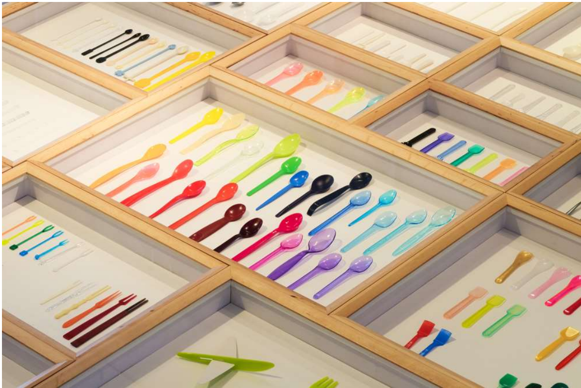
Spoon Archaeology