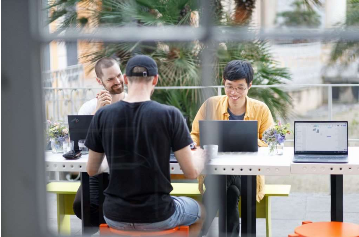
(c) TU Dresden at Design Campus