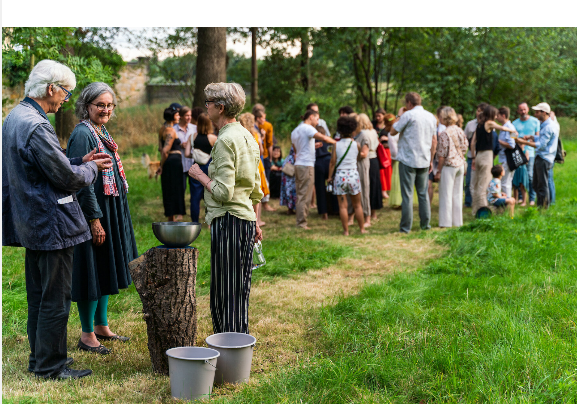
OPEN STUDIO, Workshop ERBA: Weaving Nettles Tales, © KGM/Felix Meutzner

[MUSEUM | LAB | SCHOOL | NETWORK] Plant Fever: Towards Phyto-centered Design