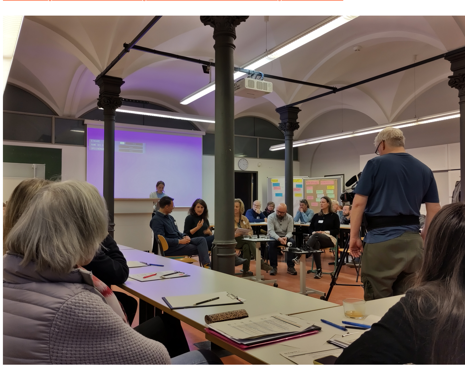
CITIZEN'S ASSEMBLY, KUNSTGEWERBEMUSEUM, HTW DRESDEN, © KGM [MUSEUM | LAB | SCHOOL | NETWORK] Design and Democracy

The DESIGN CAMPUS's inaugural Summer SCHOOL in 2021 acted as the catalyst for a comprehensive project exploring the intersections between Design and Democracy. Over the course of the six-week program, it delved into the role of design in democratic processes, shedding light on the social and political dimensions of the discipline. What began as a Summer SCHOOL has evolved into a collaborative effort across multiple institutions through our NETWORK. Leveraging our LAB structure, we experimented with citizen participation in museums, setting the stage for the project's return to the MUSEUM as a full-fledged traveling exhibition in 2025. In May 2024, the culmination of this three-year research project will materialize with the debut of the