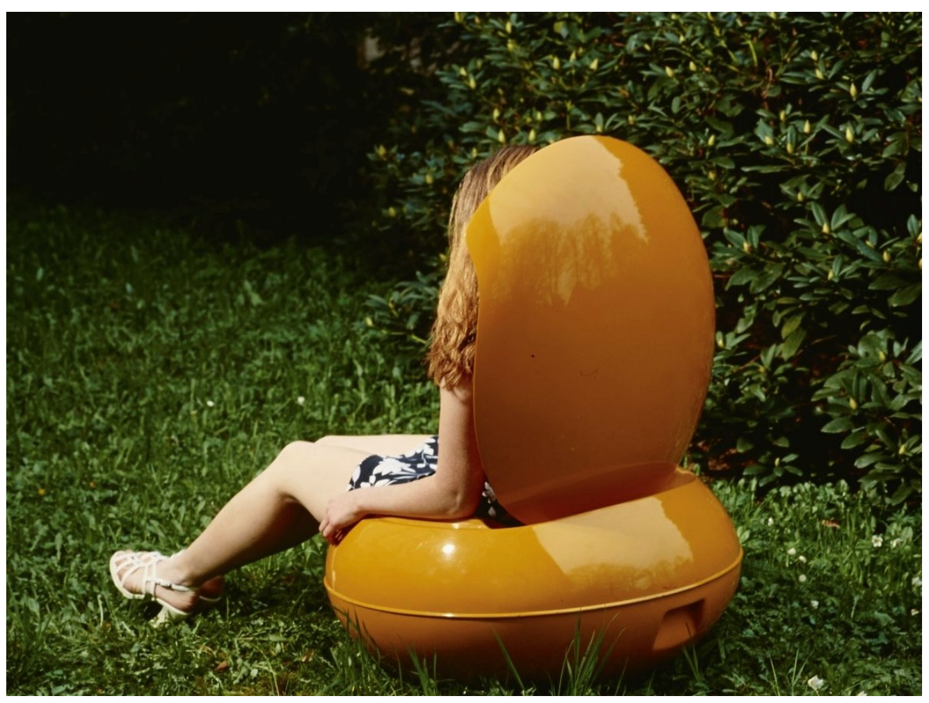
Armchair with retractable backrest "Garden Egg", design: Peter Ghyczy, 1968, VEB Synthesewerk Schwarzheide, around 1971