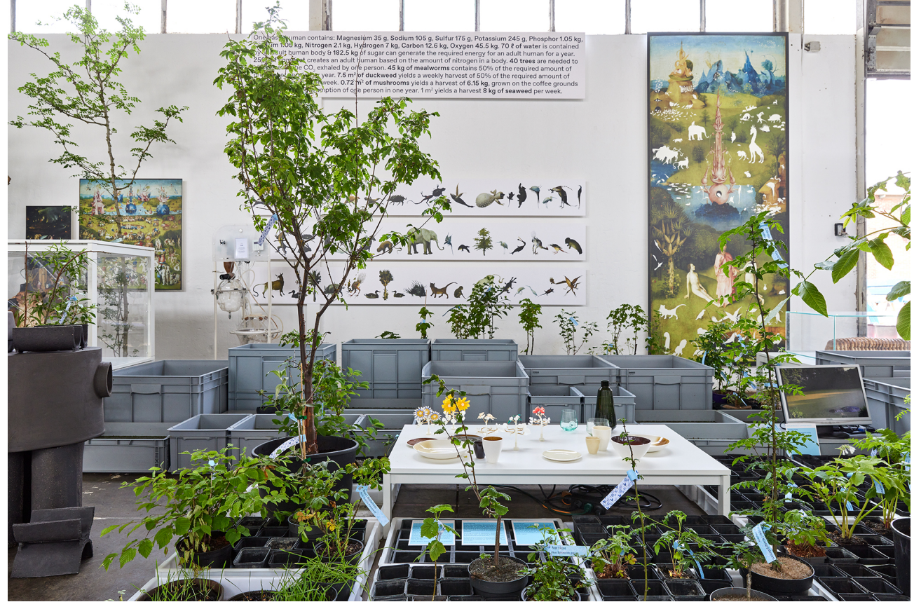
Studio Makkink & Bey, Exhibition view of Waterschool M4H+ Garden of Delight in indoor exhibition space at the International Architecture Biennale Rotterday (IABR), Rotterdam, 2021.