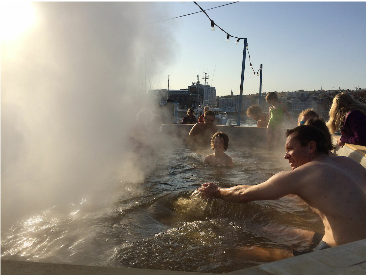
KA NO // WHAT NOW?, 2017, Tromsø, Norway