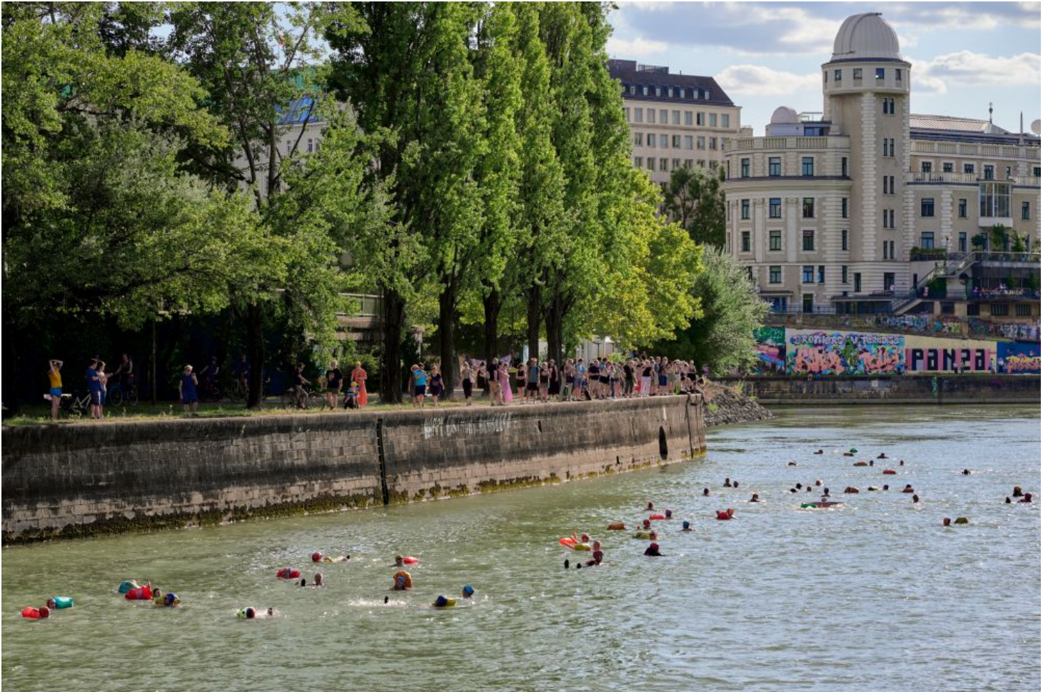
Swimmers in the Danube Canal, Vienna