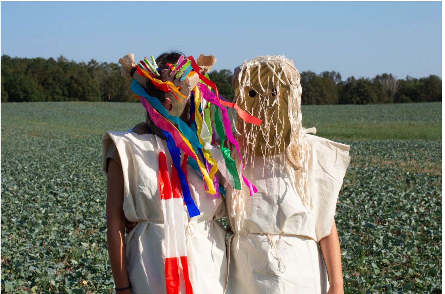
Workshop 'Cultivating Gratitude', DESIGN CAMPUS Summer School 2024