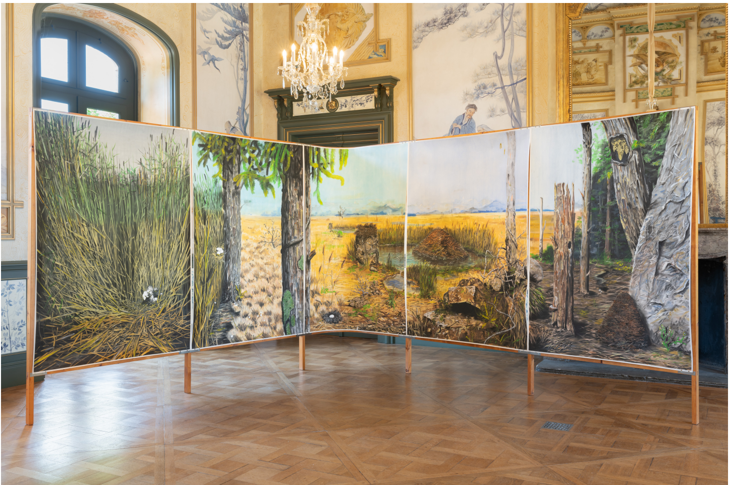
„damn nature“ by Benjamin Dittrich, courtesy Kunstfonds der Staatlichen Kunstsammlungen Dresden, exhibition view „Artists' Conquest: On nature“ - Schloss Pillnitz/Kunstgewerbemuseum